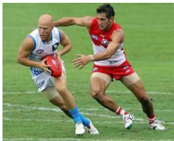
Figure 1: Can Kennedy catch Ablett?

This year, we have reverted to the simpler model we used in 2012 where points are awarded for Kicks, Handballs, Goals and Hitouts. Players on the winning team also gain an advantage that rises as the margin rises. The final two variables are the score percentage and the difference between the Supercoach score and the Dream Team score.